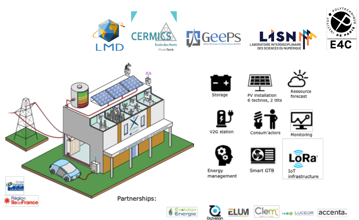
Figure 2. The Drahi-X building demonstrator scheme, with the main components and the industrial partners involved.

The NRLAB (see elements in Figure 1), is a 24 V DC system powered by a photovoltaic (PV) panel, a secondary power supplier (which makes the role of the utility) and two kinds of batteries. The consumption is set with a programmable load that reads and imposes in real time the actual electric consumption of the Drahi-X building at the scale around 1:100. All voltages and currents are measured and stored through a remotely accessible datalogger (CR1000X from Campbell Scientific). Figure 3 shows an example of the obtained measurements for a period of 5 consecutive days.