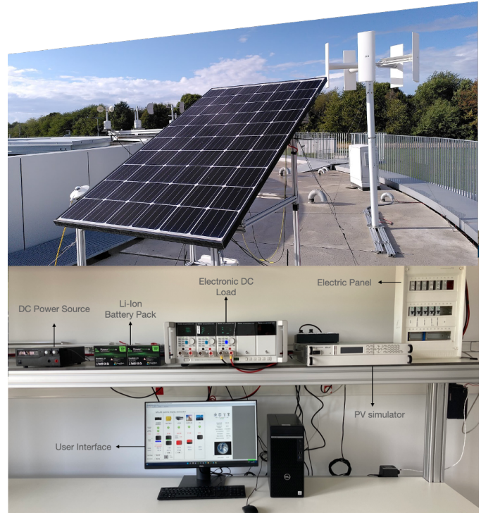
Figure 1: NRLAB views

In this context, two different scale platforms have been developed by the Energy4Climate (E4C) Interdisciplinary Centre at the Campus of IP Paris: